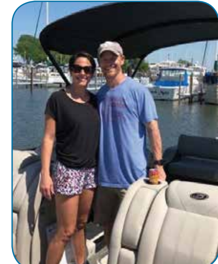
No one can tell the Barletta story better than our Barletta family...