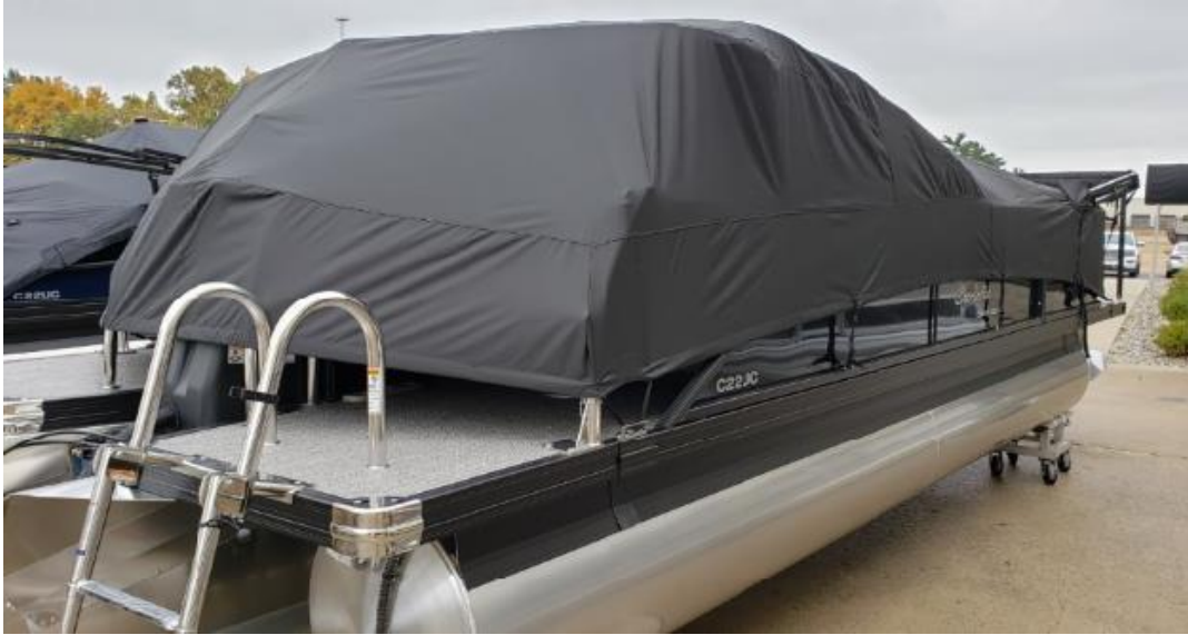
Cover may vary slightly per model selected