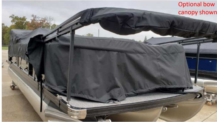
Cover may vary slightly per model selected

Drape the cover over the rails as shown (make sure to take care when draping, there is metal parts that could scratch/dent components)